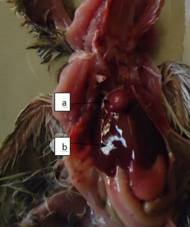
Figure 1. Photograph of a 6-week old Japanese quail inoculated intramuscularly with P. multocida. A: 3 at 10<sup>8</sup> CFU, Congestion of breast muscles of Japanese quail