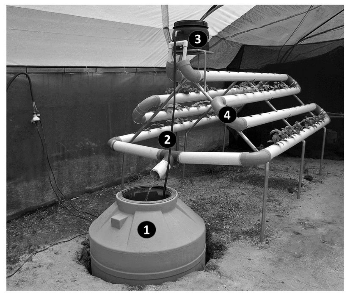
Figure 1. Components of a nutrient film technique (NFT) aquaponic module at the IICAE greenhouse, including (1) water container with a submersible pump; (2) hose to conduct the water from the tank to the biofilter; (3) biofilter; (4) PVC pipe circuits for water circulation and plant hosting.

parametric test of Kruskal-Wallis was used to compare the means values of plant longitudinal growth and biomass production. In this regard, the post hoc test of Mann-Whitney pairwise was run to determine the specific differences. The correlation between survival rate and herb species was analyzed using the Pearson's chi-squared test. Statistical analyses were performed using Past Program<sup>®</sup>, version 3.20 (Hammer et al., 2001). The significance level for the statistical tests was p < 0.05.