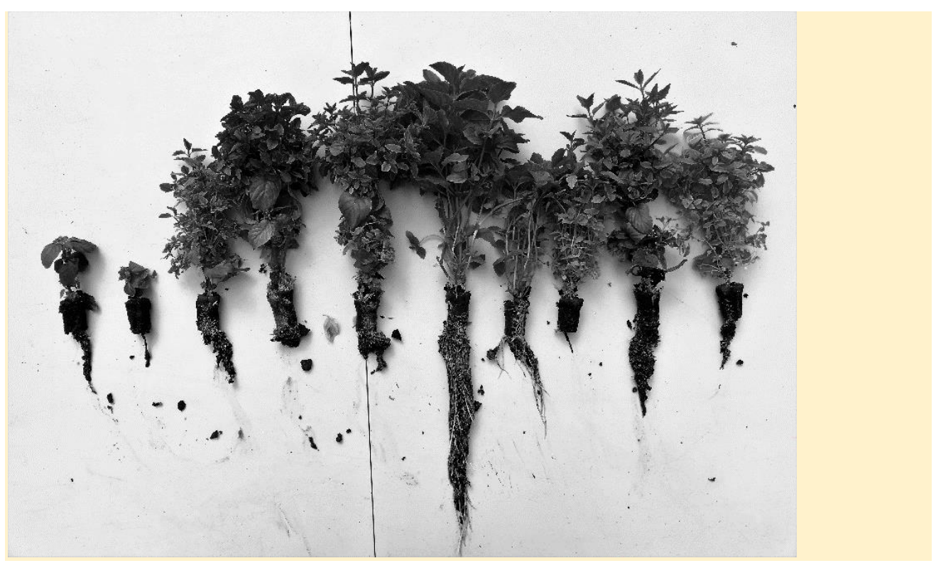
Figure 3. Variation in growth of peppermint individuals from the same block, by day 90 of observation period.