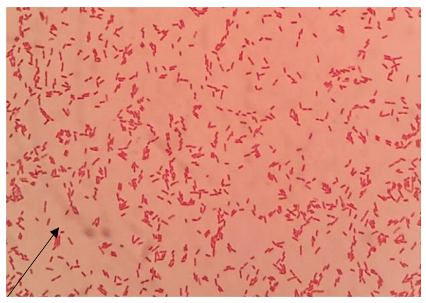
Figure 1. Six samples in the form of red Cocobacilos Gram-negative on microscopic examination with 1000 x magnification.