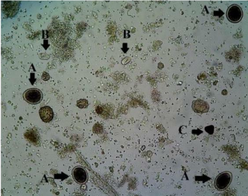
Figure 1. Worm eggs in infected cattle aged one-year-old.