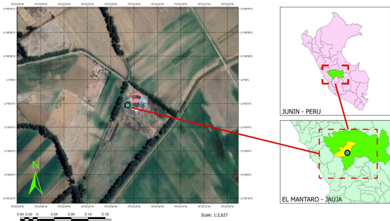
Figure 1. Location of study in Peru, specifically in the Junín region and within Junín, the research focused on El Mantaro, located in the province of Jauja

The analyzed data were recorded and organized in Microsoft Excel. Seasonal (rain and dry season) differences were performed using analysis of variance (ANOVA). A comparison test was then performed. Values of p < 0.05 were considered significant and all statistical analyses were performed using CRAN R software (Team et al., 2018).